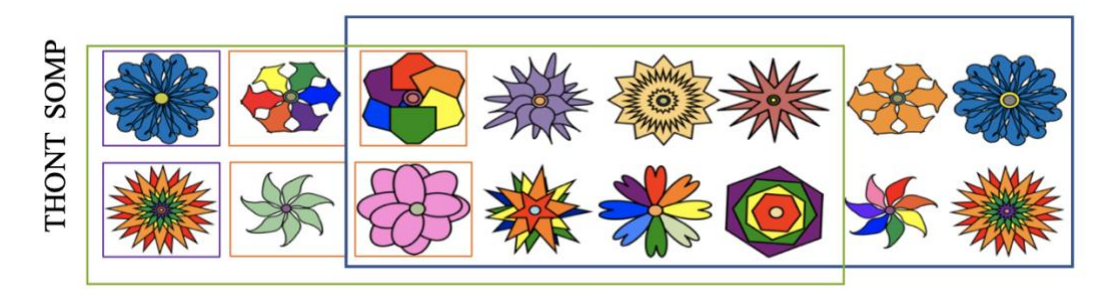
Fig. 3. Kon and Lombrozo's experiment. The better rule is that SOMP flowers have two concentric circles in their centres while THONT flowers have one circle in their centre. The worse rule is that the petals of SOMP flowers are mostly one colour, whereas the petals of THONT flowers are mostly rainbow coloured. The blue box contains the items in the ideal scenario; the green box contains the items in the non-ideal scenario (see ibid., 1941). Reproduced by permission from Cognitive Science .